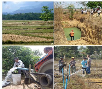
Pictures: (a) Typical dry season landscape of Vientiane Plain; (b) farmer dug-well and shallow water-table (dry season) (c) 'Tok-Tok' pump used for groundwater abstraction; (d) IWMI's pilot site with groundwater irrigation of cash-crops

Current use of GW is 12 mm/year or 2,5% of annual recharge, suggesting a important scope for increasing abstraction.