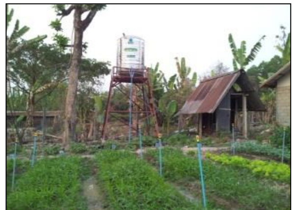
Set up of the demonstration and research trial